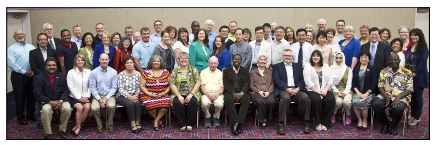
IAFP 2015 Affiliate Council Delegates and Representatives

*Delegate is currently not an IAFP Member, as of April 15, 2016 (a requirement under IAFP Bylaws).